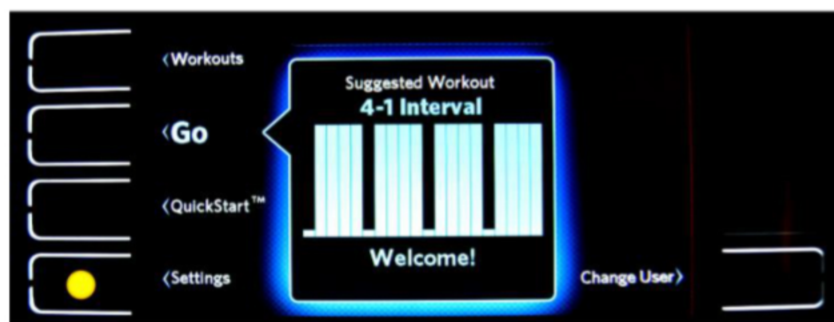
R40 Console Home page